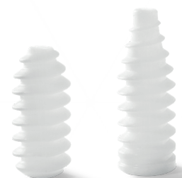
Available in different sizes Composite of Poly-lactic

Read instructions for use for a complete list of warnings, precautions, possible adverse events and other important medical information.